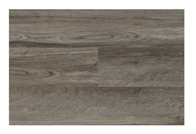
SKYLINE 7" SPC FLOORING