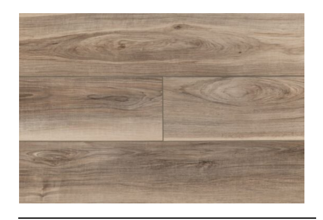
AMBERCROFT 7" SPC FLOORING