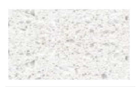
BLANCO MAPLE QUARTZ COUNTERTOP