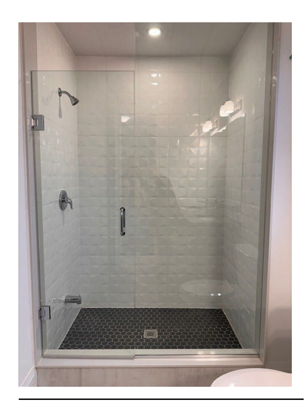
FRAMELESS GLASS SHOWER ENCLOSURE PRIMARY ENSUITE