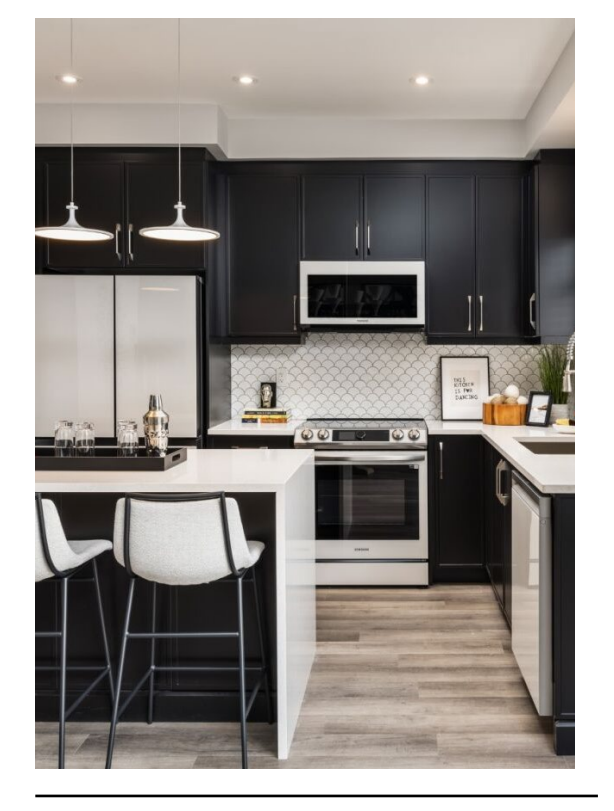
UPGRADED SPC IN KITCHEN FLOORING