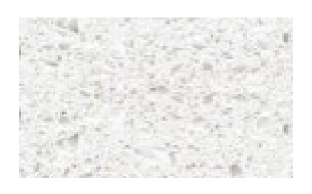
BLANCO MAPLE QUARTZ COUNTERTOP