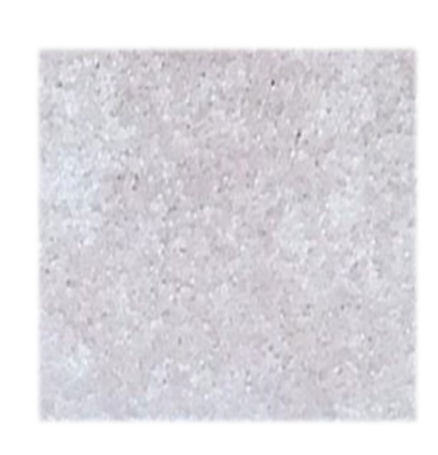
SO SWEET 21 CARPET