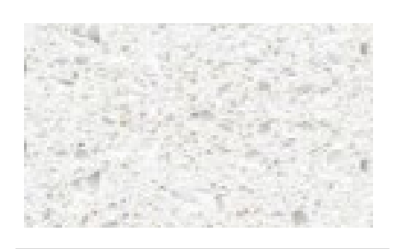
BLANCO MAPLE QUARTZ COUNTERTOP