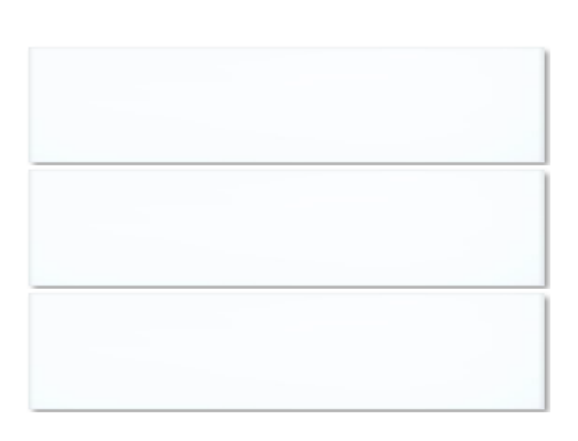
C&D ARCTIC WHITE MATTE 4"x16" WALL TILE