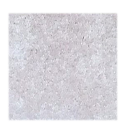
SO SWEET 21 CARPET