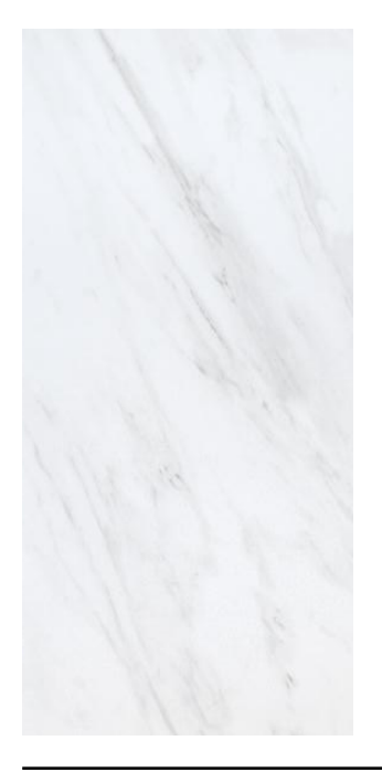
VOLKAS WHITE POLISHED 12"x24" FLOOR TILE