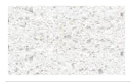
BLANCO MAPLE QUARTZ COUNTERTOP