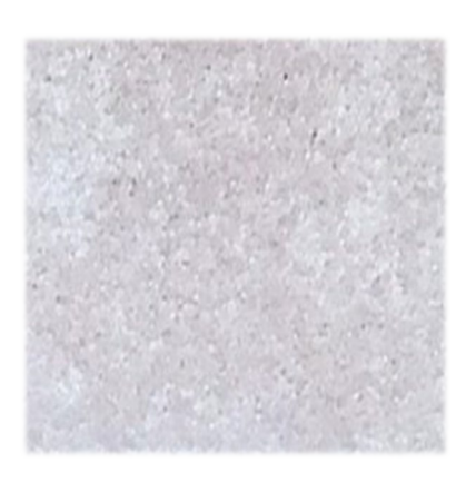
SO SWEET 21 CARPET