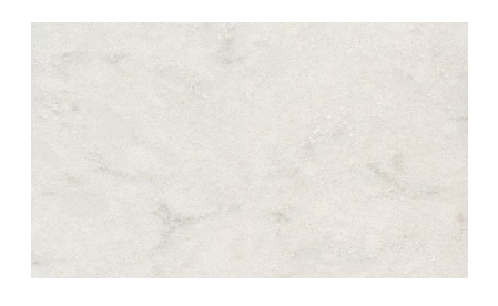
LAGOON QUARTZ COUNTERTOP